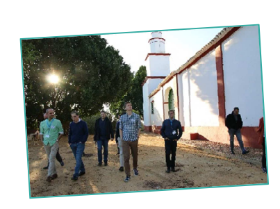
#capri_ts2019 ...the common language of agricultural markets and policy analysis AND impacts on the environment

The CAPRI system strongly benefitted from EU Commission support in various forms. Most of the initial developments were co-financed by DG-RSRCH through the series of past FP and H2020 projects. Furthermore, the DG-JRC (D.4 in Seville and D.5 in Ispra) has actively contributed to improvements and extensions in various components of the system. Since some years, recurring demand for up-to-date and long run projections on the part of DG CLIMA is contributing to regularity in the updating process for the database and projections.